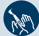
Inspection and maintenance

Designed to give you the best. The best performance in a simple and fast workflow. An innovative thermal disinfectant that replaces the numerous manual tasks typical of the stages preceding sterilization, thus reducing workloads. Equipped with the optional HMD accessory, Tethys H10 extends the reconditioning process to rotating instruments, resulting in unparalleled performance.