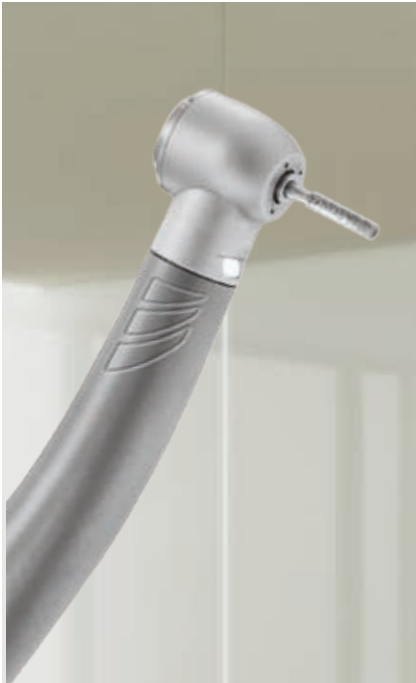
EVO MINIATURE K